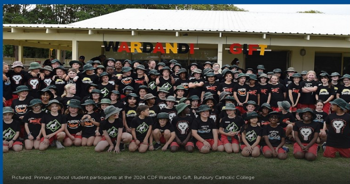
Pictured: Primary school student participants at the 2024 CDF Wardandi Gift, Bunbury Catholic College

Phone (08) 9791 3750 Fax (08) 9791 3751 Mobile 0412 561 621 A/h (08) 9721 4778